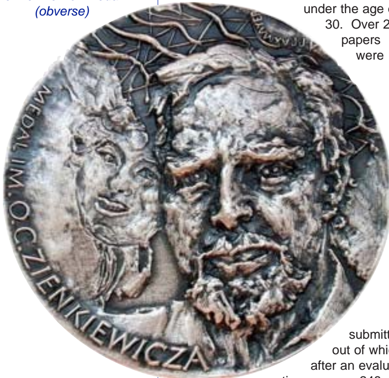
Figure 3: The Zienkiewicz Medal (obverse)

submitted out of which, after an evaluation process, 248