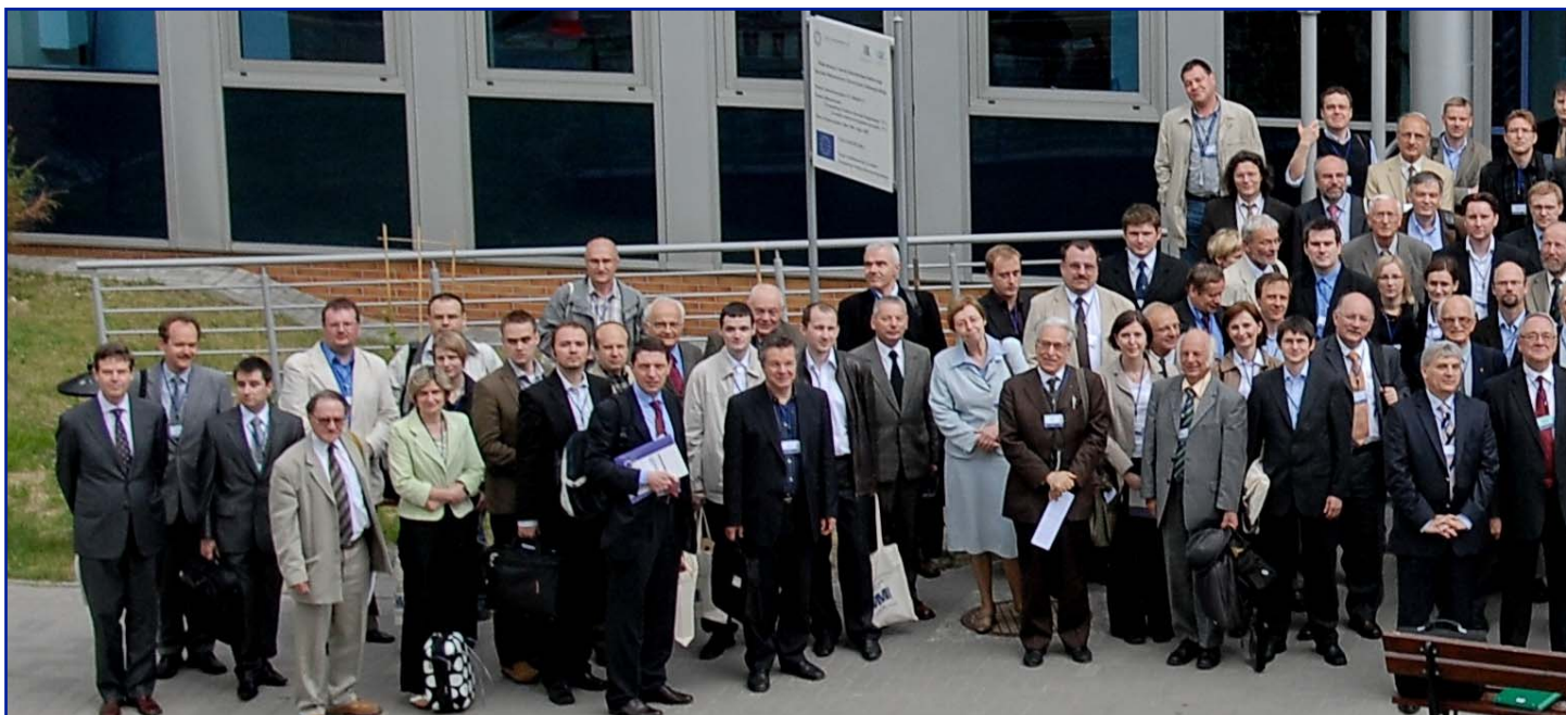
Figure 1: Participants of the CMM 2009 (after the opening session)